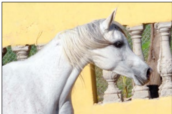
Nogara El Ludjin x Res. National Champion Narah el Jamaal Important matriarch at Haras Meia Lua