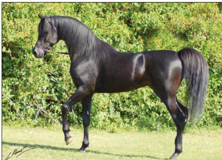
Perseus el Jamaal, x Perfectsbahn SRA (Bey Shab), 2002 black stallion. One of the influential stallions at Haras Meia Lua