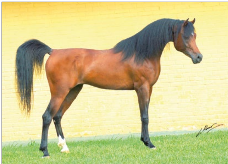
Yllan el Jamaal