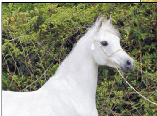
Jylda el Jamaal x Jullye, Haras Meia Lua