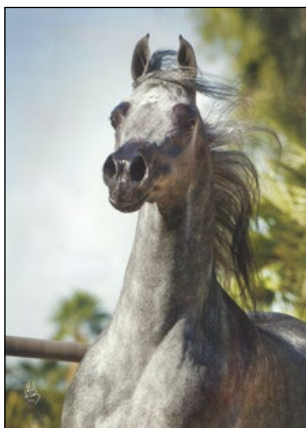
Saudi el Perseus, now in Australia, x Silk el Jamaal