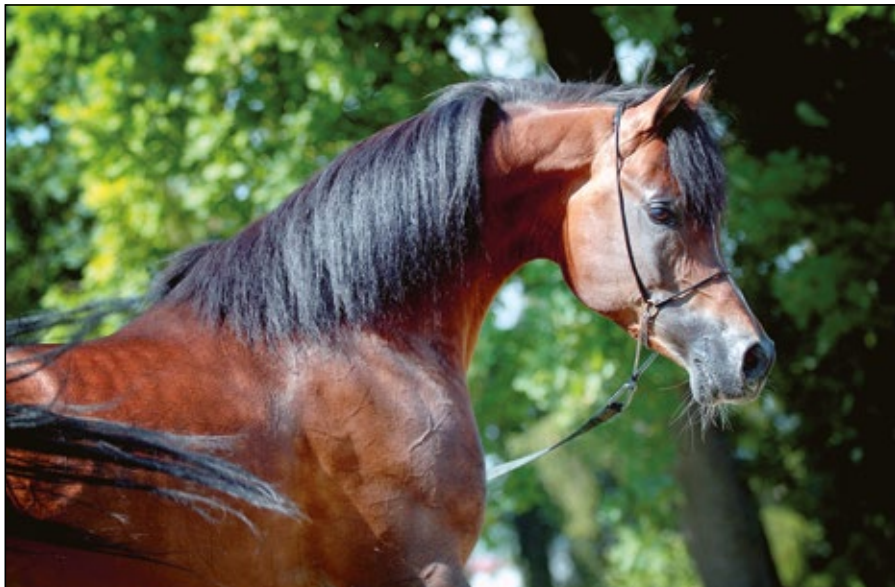
Javier el Jamaal by Juliet (now Dubai Arabian Horse Stud) son of Juliet