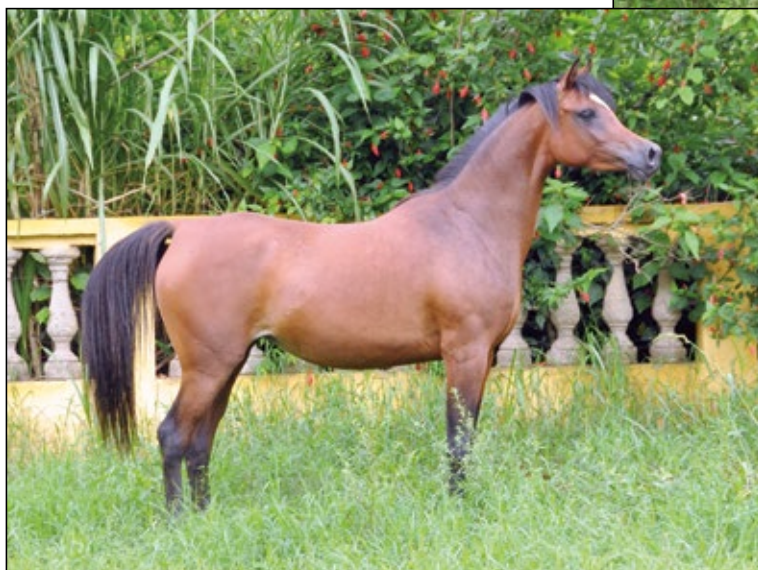
Erynnel el Perseus, daughter of Ermyne, (3 times Jamaal)