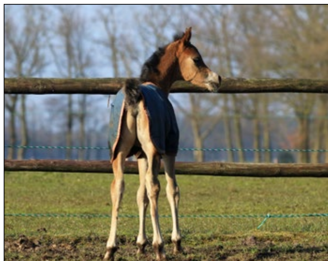
ASE Gabriella al Gazal Gazal al Shaqab x Geraldnye el Jamaal, 2018 Bay filly