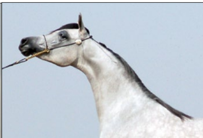
Berylle el Ludjin, Brazilian National Champion filly, x TW Bey Fantaishab (Bey Shab)