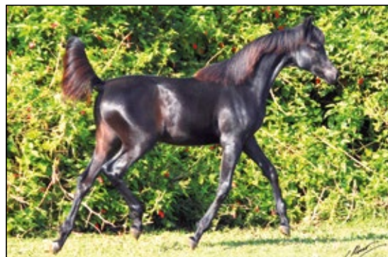
Tessara el Perseus x Talara el Jamaal