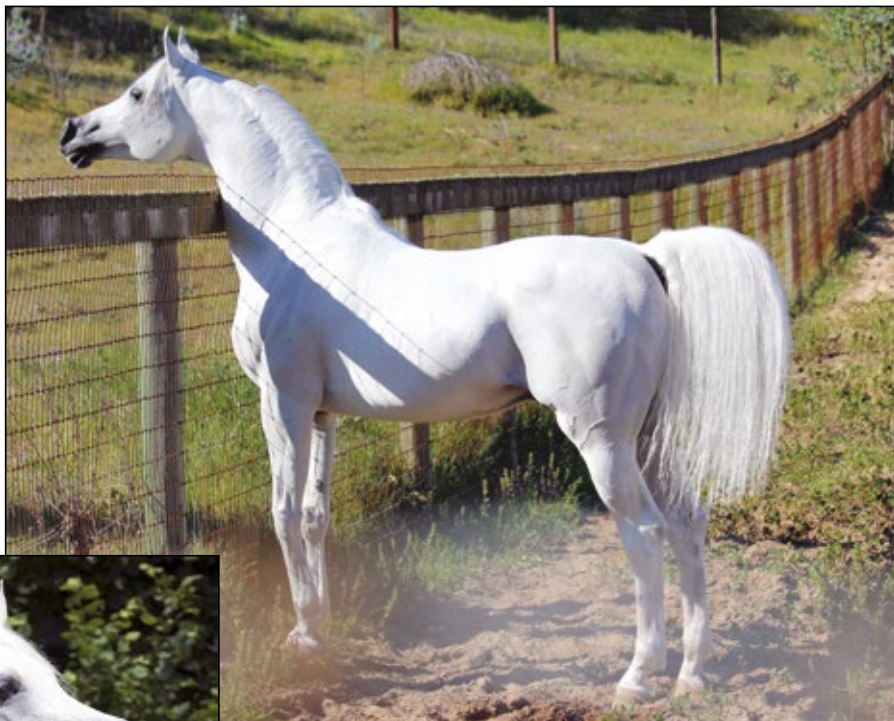
Dakar el Jamaal