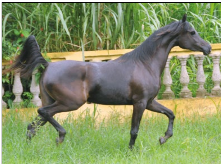
Electra el Perseus, daughter of Ermyne, (3 times Jamaal)