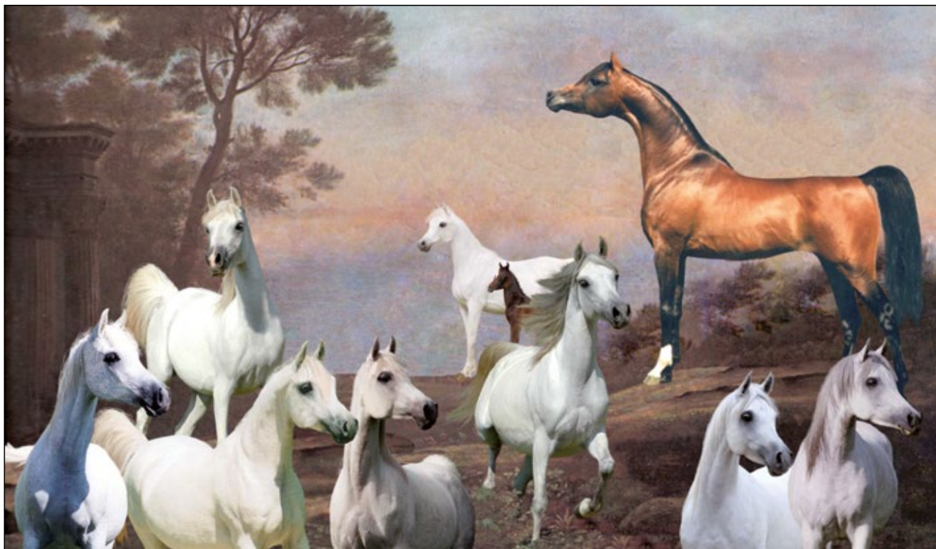
Ali Jamaal with grey daughters