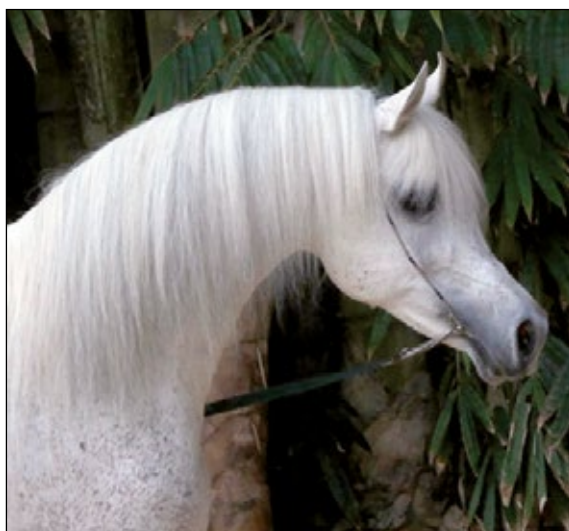
Ludjin el Jamaal at 20 years old.