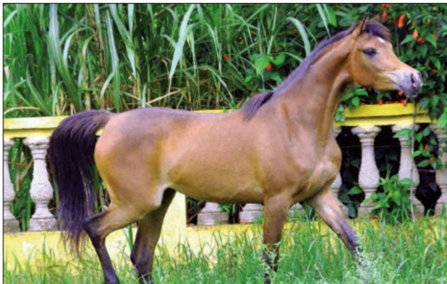
Niceya el Perseus x Nogara el Ludjin (3 times Jamaal)