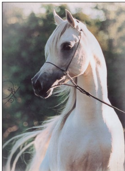
Ryad el Jamaal