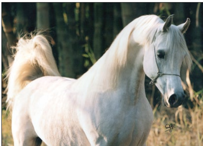
Nybl el Jamaal