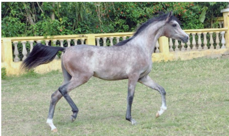
Jaya Enzo x Jullye, Haras Meia Lua