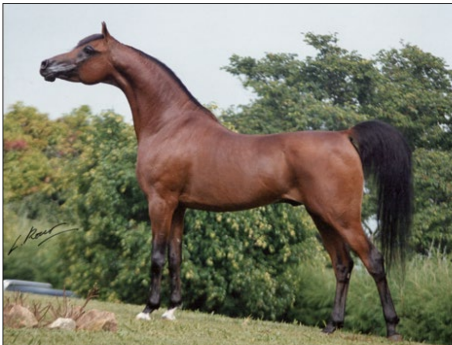
Lethyf el Jamaal Res. National Champion