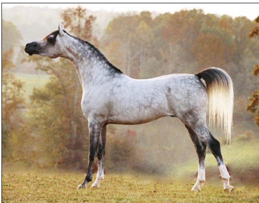
Dakar el Jamaal- US National Champion x Sonoma Lady (US. Res, National Champion)