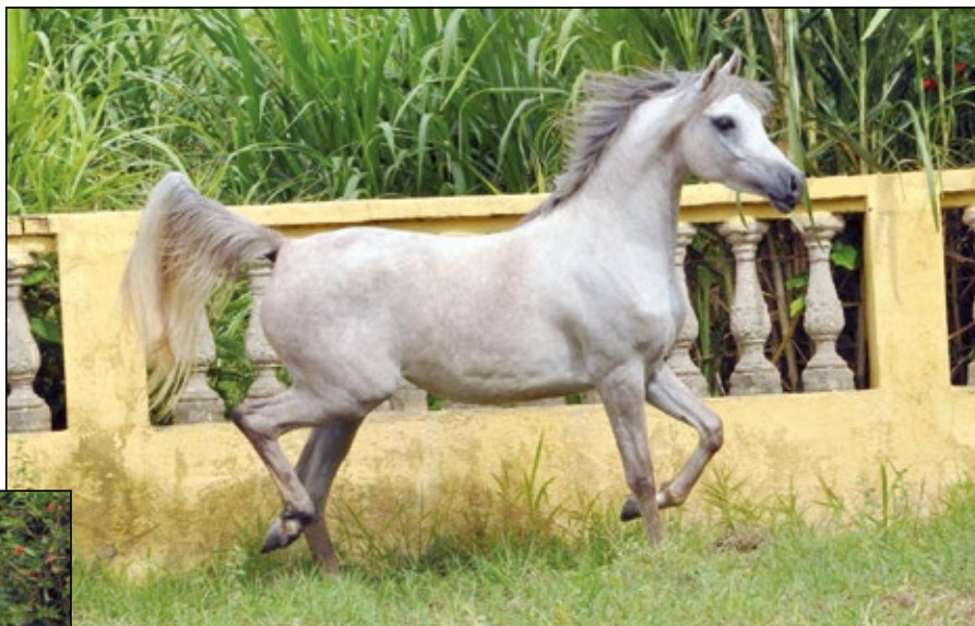
Ghydara el Perseus