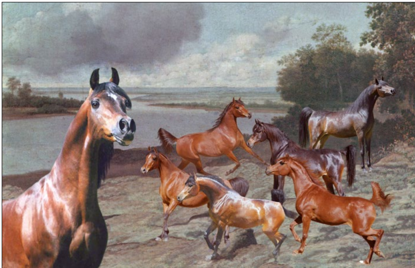
Ali Jamaal with bay daughters