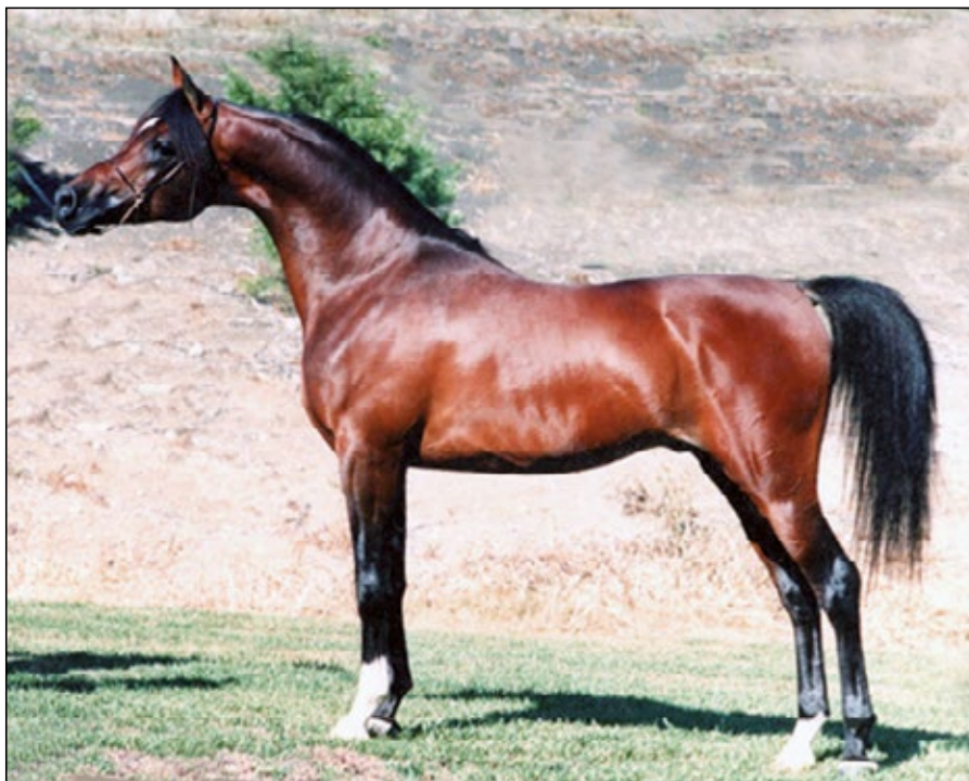
Ali Jamaal after he was acquired, as a 4 years old