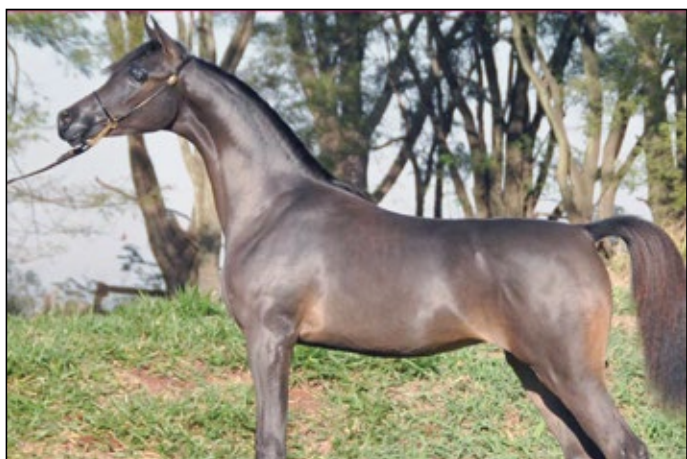
Haidée el Perseus , x Harklée el Ludjin