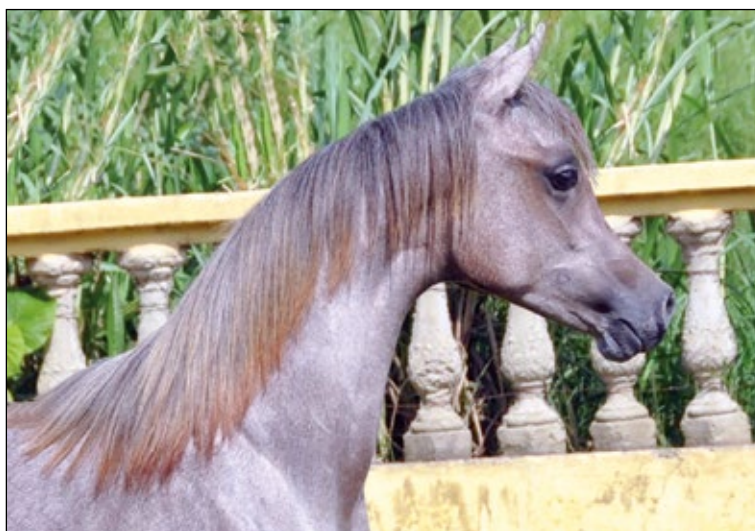
Gdynia el Perseus, owned by Santa Ventura